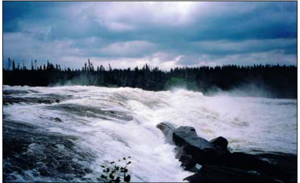
Photo of Oatmeal falls in 2006

The Canadian Canoe Museum is pleased to partner with expedition outfitters